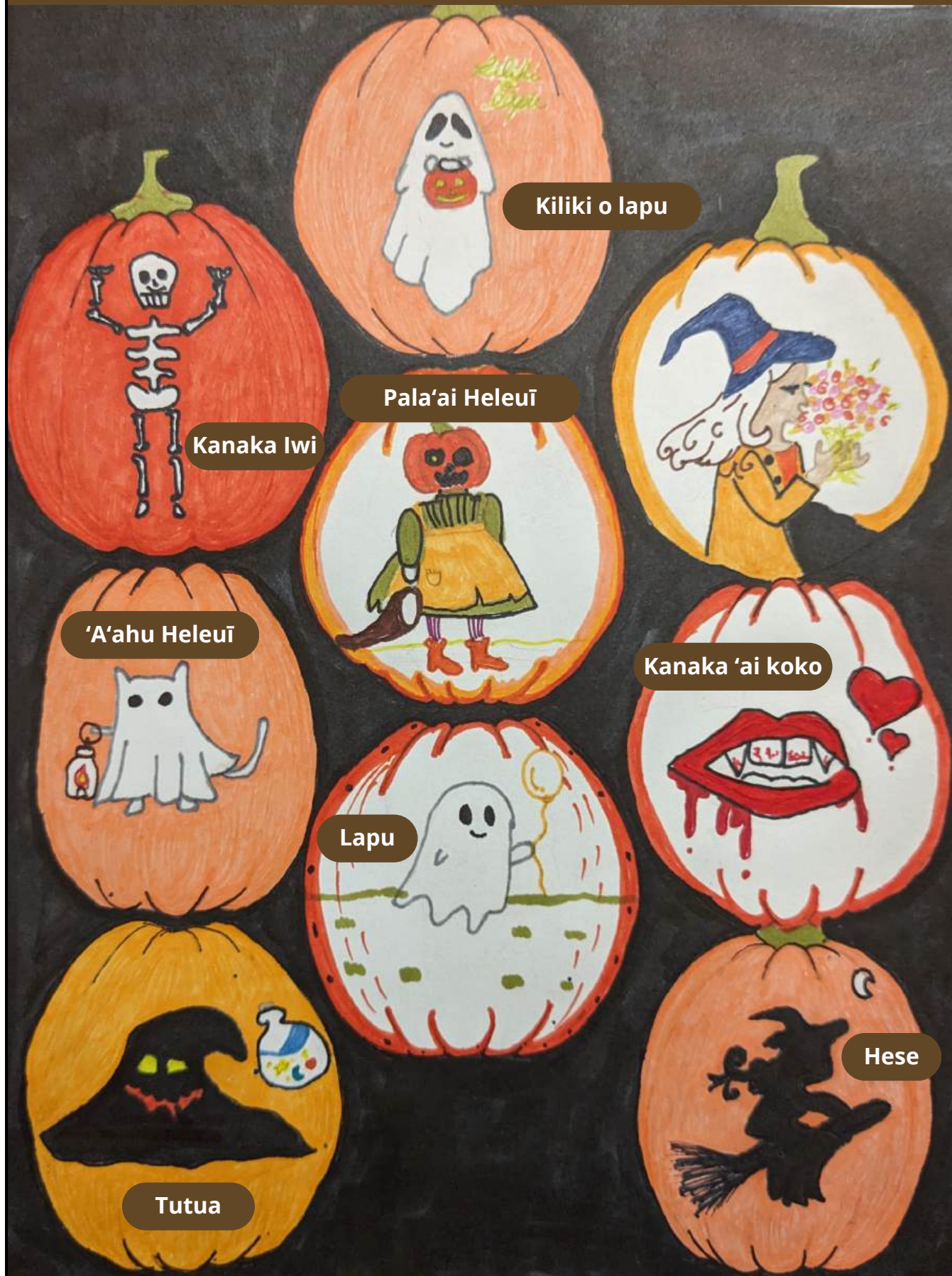
Kiliki o lapu